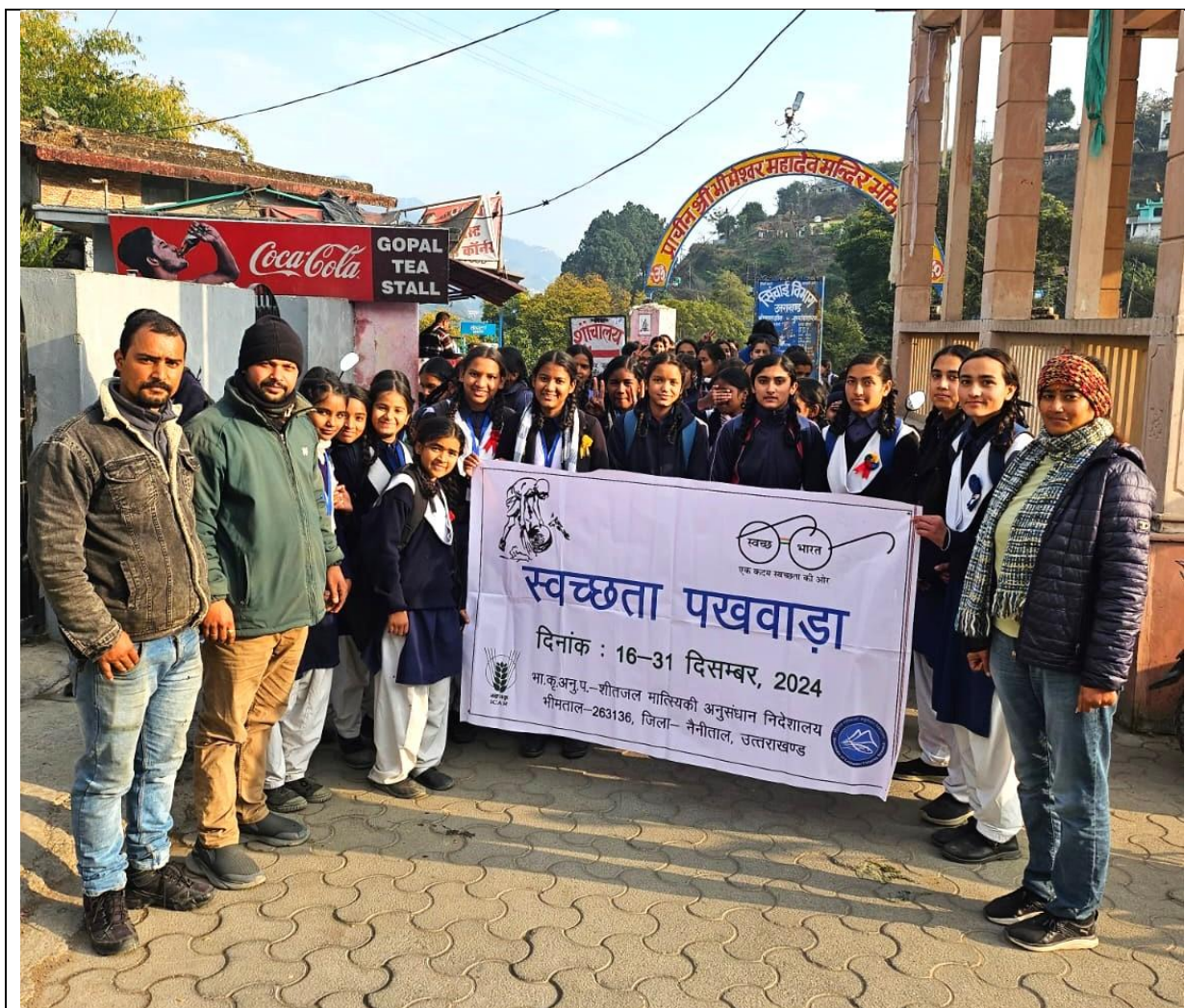
‘Swachhata Awareness’ at the local level: Organizing Signature Campaigns involving local youth and Girls students of Saraswati Pandey Government Girls Inter College at Dart, Bhimtal, Nainital, Uttarakhand